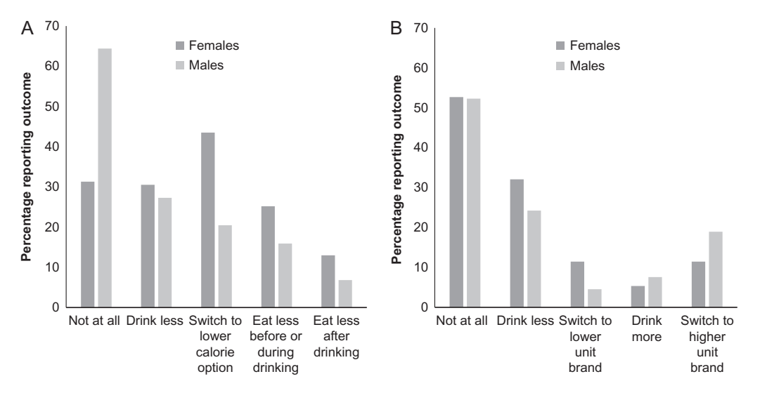
Fig. 2. Responses to the question (A) 'How would calorie information influence your alcohol consumption?' and (B) 'How would unit information influence your alcohol consumption?'.