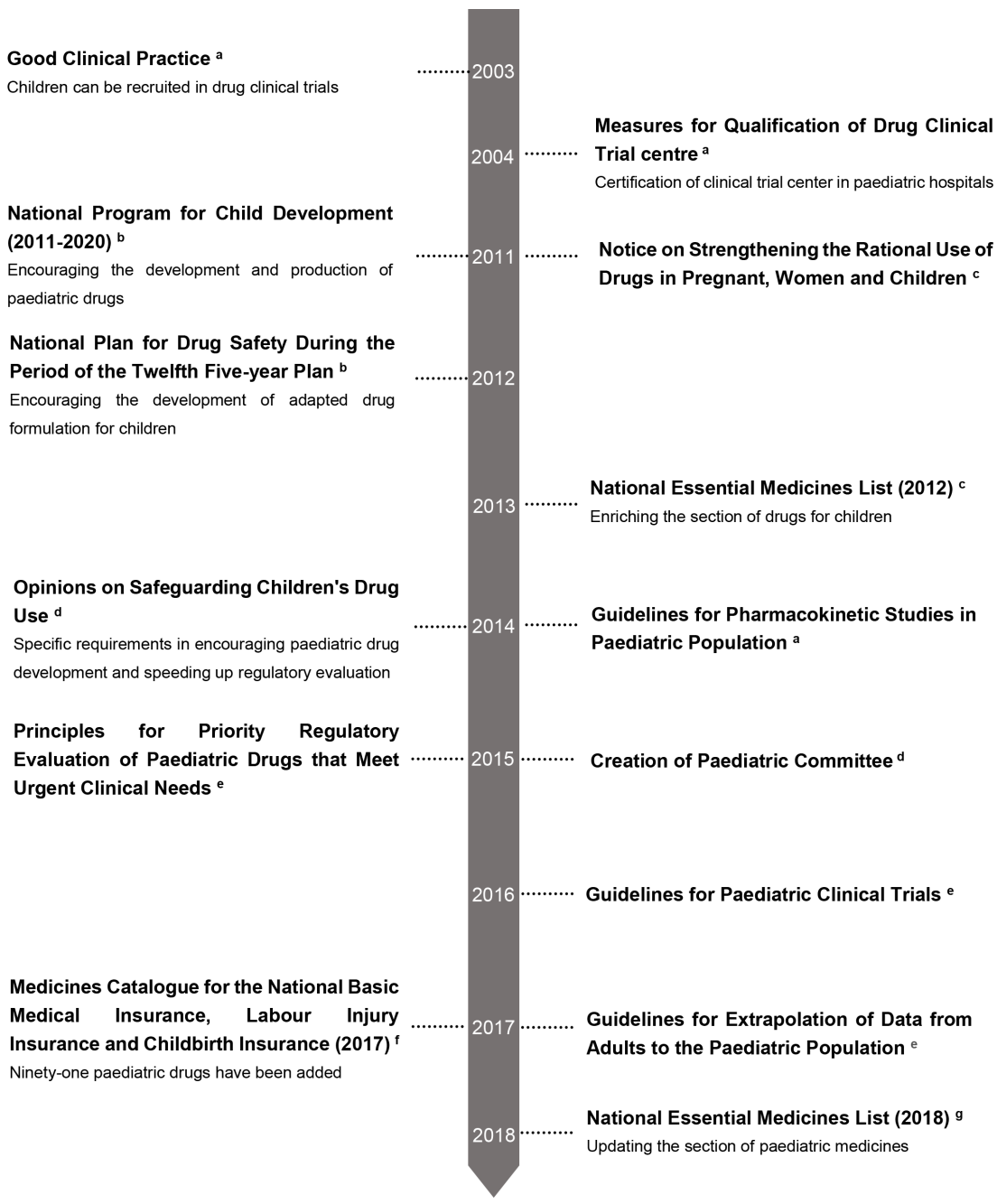
Figure 2 Policies on paediatric drug trials in China. (a) State Food and Drug Administration, SFDA (now namely National Medical Products Administration, NMPA); (b) The State Council; (c) Ministry of Health (now namely National Health Commission); (d) National Health and Family Planning Commission, NHFPC (now namely National Health Commission); (e) China Food and Drug Administration, CFDA (now namely NMPA); (f) Ministry of Human Resources and Social Security; (g) National Health Commission.