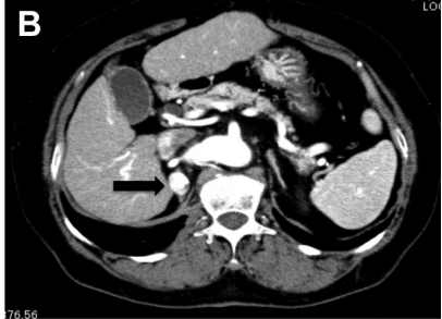
Figure 1. (A) Computed tomography demonstrates an 11-cm solid enhancing tumor in the left moiety of a horseshoe kidney (left). (B) Computed tomography images of right adrenal tumor (a black arrow) which showed dynamic contrast enhancement pattern (right).

fascia was widely dissected to expand the retroperitoneal space. A significantly tortuous aorta was observed close to the lumber quadrate muscle. The ablation of fatty tissue was performed to determine the positional relationship in the cavity. The inferior vena cava and the right side of the horseshoe kidney were not identified at that point. Although the dissection of fatty tissue along the aorta progressed, the adrenal tumor was found near the aorta (Fig. 2). The adrenal gland with the tumor was fully exposed by the dissection of the surrounding tissue with adequate hemostasis. Finally, the adrenal central vein was verified and triple-clipped and cut. The specimen was placed in the endoscopic pouch and retrieved through the trocar port. The operative time was 173 minutes with minimal blood loss. There were no complications during the perioperative period. The patient was discharged on the eighth postoperative day.