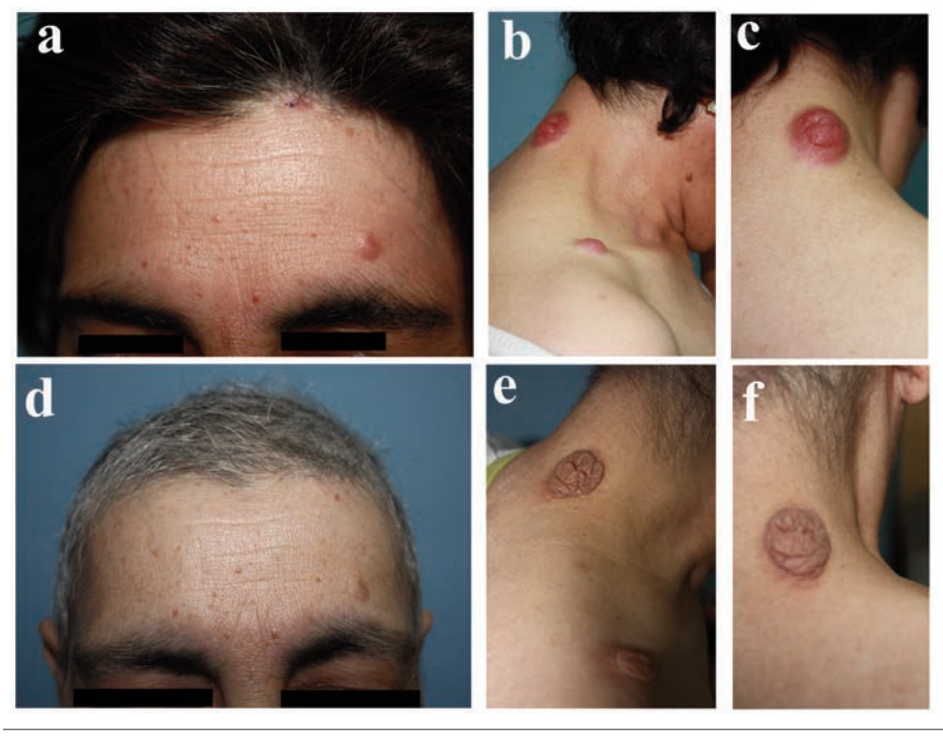
Figure 1. (a,b,c) Numerous asymptomatic fleshy appearing papules and nodules with an elastic texture on the forehead, neck and right shoulder of the patient (d,e,f) Shriveling of the skin nodules, 3 months later after the start of dosetaxel + cisplatin + infusional 5-Fluorouracil chemotherapy.

content and epithelial origin, malignant cells of SRCC can be identified with certain stains. Mucicarmine, periodic acid-schiff stains (PAS) are helpful in identifying the mucin content and AE1/AE3 pancytokeratin antibody can be used to confirm the epithelial origin of the SRCs and to distinguish normal, metaplastic and neoplastic cells. Since adenocarcinomas originating from tissues other than gastric mucosa may also present with SRCs, other immunohistochemical investigations may be