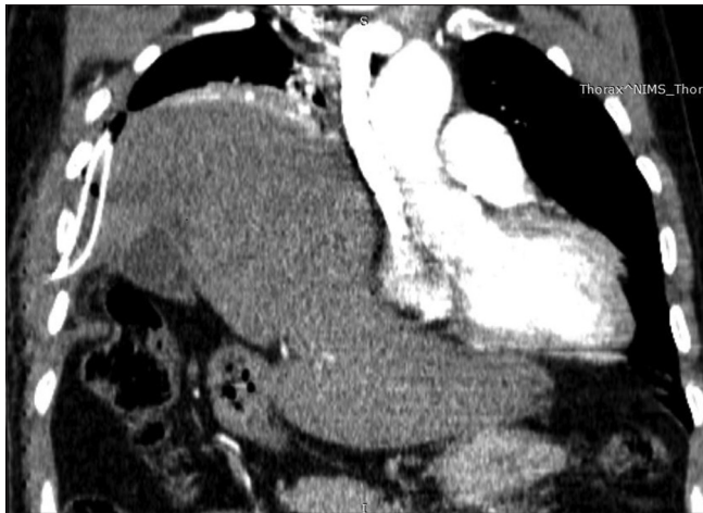
Figure 3: Coronal transformation of CT thorax, showing anterior part of ruptured leaf of the diaphragm with ICTD in situ , right lobe of liver, omentum, gall bladder, a segment of hepatic flexure herniating into the thoracic cavity through the vent in the diaphragm with capsular breach of the posterior part of the right lobe of liver, and collapsed lower lobe of the right lung

We presume that, had the ICTD not been attempted, the injured muscle might have continued to maintain normal trans-diaphragmatic pressure gradients and a barrier across the two cavities. There could have been a chance of natural repair by healing. This also explains why only a some cases of TDR develop hernia while others escape, as observed by Kozac et al. [7]