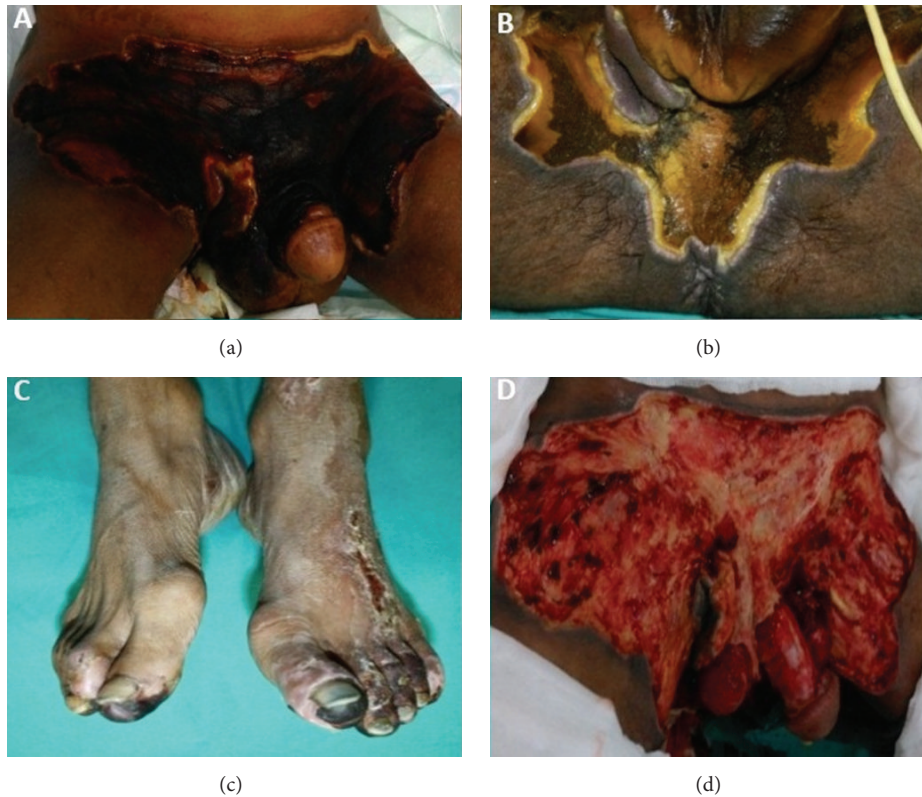
FIGURE 1: Fournier's gangrene caused by Acinetobacter baumannii . Anterior aspect of the patient's pelvic wound before the surgical debridement (a), posterior aspect of the patient's pelvic wound before the surgical debridement (b), the patient's foot wound before the surgical debridement (c), and the patient's wound after the surgical debridement (d).

had partial gangrene in both toes (Figure 1(c)). Cultures of samples taken from the perineal wound site grew Acinetobacter baumannii susceptible to colistimethate sodium (colistin). The toes wound culture also grew Trichosporon asahii susceptible to fluconazole. On the 5th day of treatment, he underwent debridement of extensive necrotic tissue at the edge of sufficient blood supply to the wound (Figure 1(d)). Additionally, colostomy was opened to protect the wound. Negative pressure wound therapy was applied to the surface of the debrided area and intermittently continued for 45 days (Figure 2(a)). The wound was convenient to dressing with flapping in the forty-five days after the surgical debridement (Figure 2(b)). Defect was closed with partial-thickness skin grafts taken from the front of the thigh and also anterolateral thigh flap with a proximal pedicle 50 days after the first application (Figures 2(c)-2(d)). He was discharged from the hospital 80 days after the first admittance.