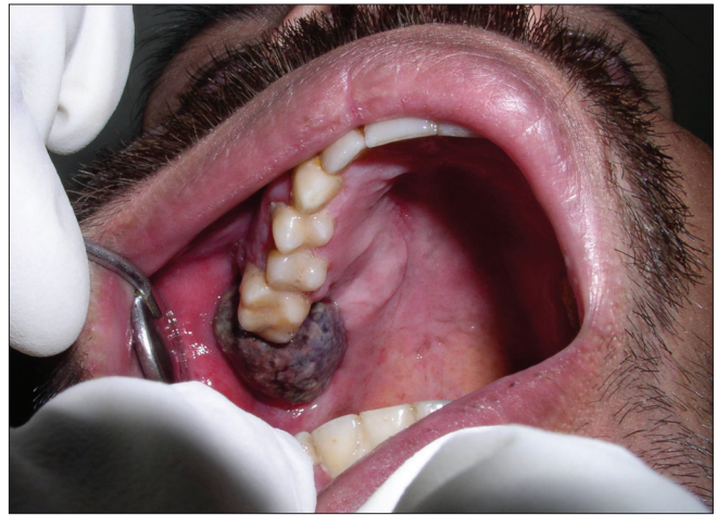
Figure 1: Clinical image showing growth in right maxillary posterior region

The pathogenesis of BL is due to the c-myc immunoglobulin (Ig) translocation and is thought to occur as a result of an error in activation induced cytidine deaminase (AID)-mediated Ig class switch recombination in germinal centers. [2] The most common translocation in BL is the t (8;14) in which there is fusion of cMYC to the immunoglobulin (Ig)H locus. [6]