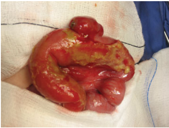
Fig. 1 Solitary ileal hemangioma with perforation site.