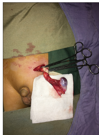
Figure 1: Inguinal incision and early clamping of the spermatic cord

Spleen originates from the mesenchyme of left dorsal mesogastrium. Gonads, however, are derived from the genital ridges on the posterolateral wall of the embryo. [1,2] It has been postulated that SGF arises due to an abnormal