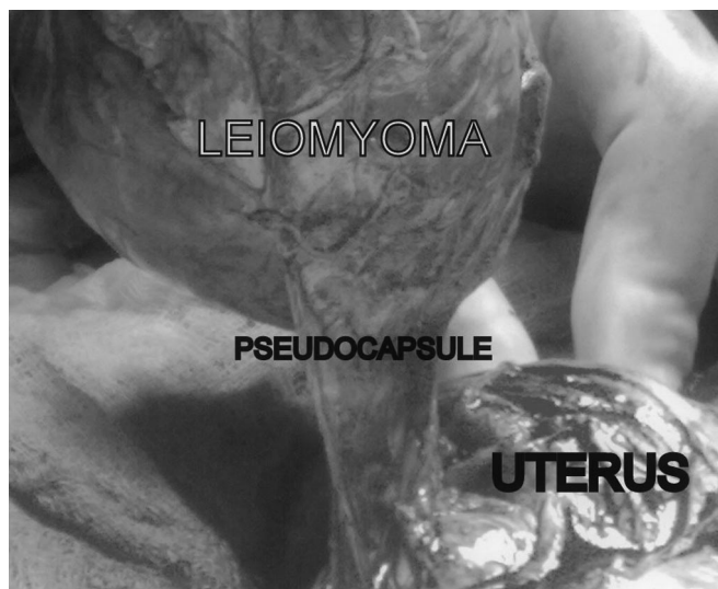
Figure 3. An intraoperative image of laparotomic myomectomy showing a fibroid pseudocapsule during myoma stretching by the surgeon from myometrium.

Walocha et al 32 performed a microstructural evaluation of the fibroid pseudocapsule and found that the density of blood vessels increases around the myoma. As the fibroid grows, new blood vessels penetrate the tumor from its periphery where “the vascular capsule” network is formed. Some of the vessels in the pseudocapsule connect at the base of the myoma and form a little foot ( Figure 3 ) that often bleeds during an extracapsular myomectomy. These authors analyzed the fibroid vascular system using corrosion casting combined with scanning electron microscopy and affirmed that the pre-existing blood vessels undergo regression and new vessels invade the tumor from the periphery during the development of myomas. Myoma pseudocapsule originates from small vessels entering the tumor from the periphery, forming a “vascular network” around the myoma, with flattened veins com-