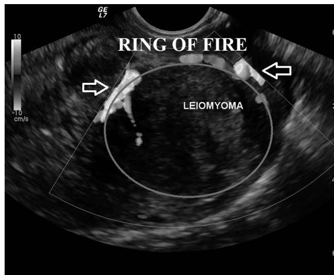
Figure 2. A uterine transvaginal ultrasound section evidenced the fibroid pseudocapsule by a “ring of fire” around the fibroid.

trium, forming a hyperechogenic ring that surrounds and defines the myoma. 6 To help understand micro-neuroanatomy of the fibroid peripheral area, we should understand the story of the pseudocapsule. An anatomical textbook, published at the end of last century, asserted that, “myoma shows a nodular aspect, a round image, well circumscribed, to enucleate even if they miss a pseudocapsule.” 25 These authors confirmed the existence of a fibroid pseudocapsule and identified the cleavage plane, which should be respected during myomectomy. 6 The first article that described a fibrovascu-