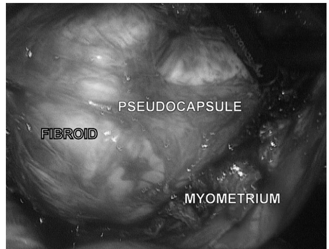
Figure 5. A laparoscopic image showing fibroid enucleating from myometrium by monopolar Hook electrode gentle cut of pseudocapsule by low-wattage energy, to expose the myoma surface, with a magnification of the pseudocapsule during myoma removal.

Once the myoma pseudocapsule is identified, it is exposed by atraumatic clamp or by irrigator cannula, to provide a panoramic laparoscopic view of the pseudocapsule of all subserous-intramural leiomyomas. Then, the surgeon affects the pseudocapsule by a longitudinal cut, using monopolar scissors or a Hook electrode at low wattage (30 watt), to expose the myoma surface ( Figure 5 ). The fibroid is then secured by a myoma screw or Collins laparoscopic forceps to perform the traction necessary for its enucleation, helped by an irrigator cannula inserted in the space under the myoma pseudocapsule and fibroid. Hemostasis of small vessel bleeding is achieved by a