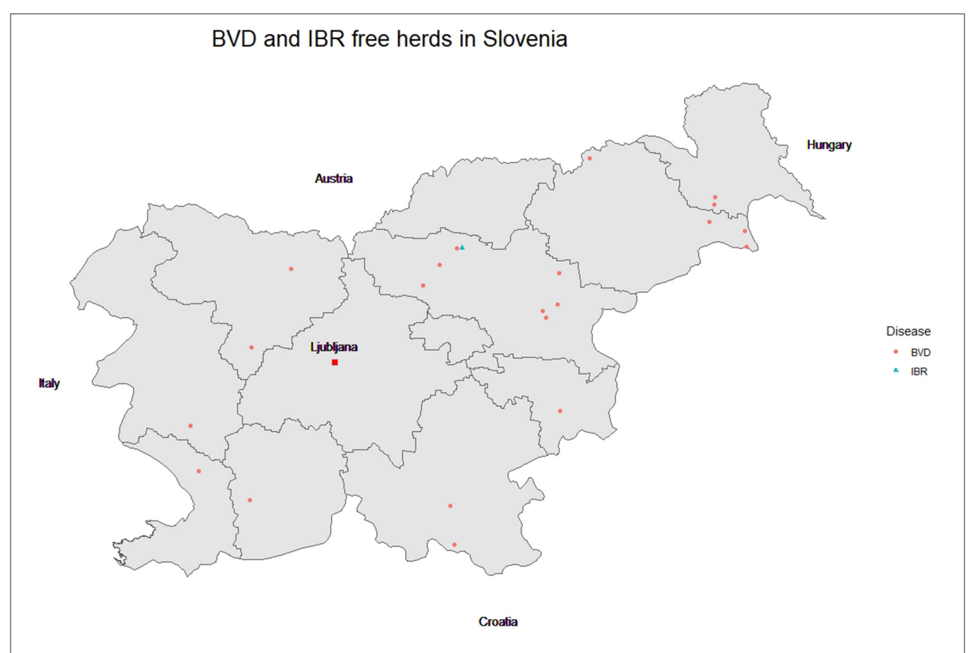
FIGURE 3 | Location of bovine viral diarrhoea (BVD) or infectious bovine rhinotracheitis (IBR) officially free herds. Note that the only herd free of IBR also has a BVD-free status but the markers are misaligned for better visualisation.