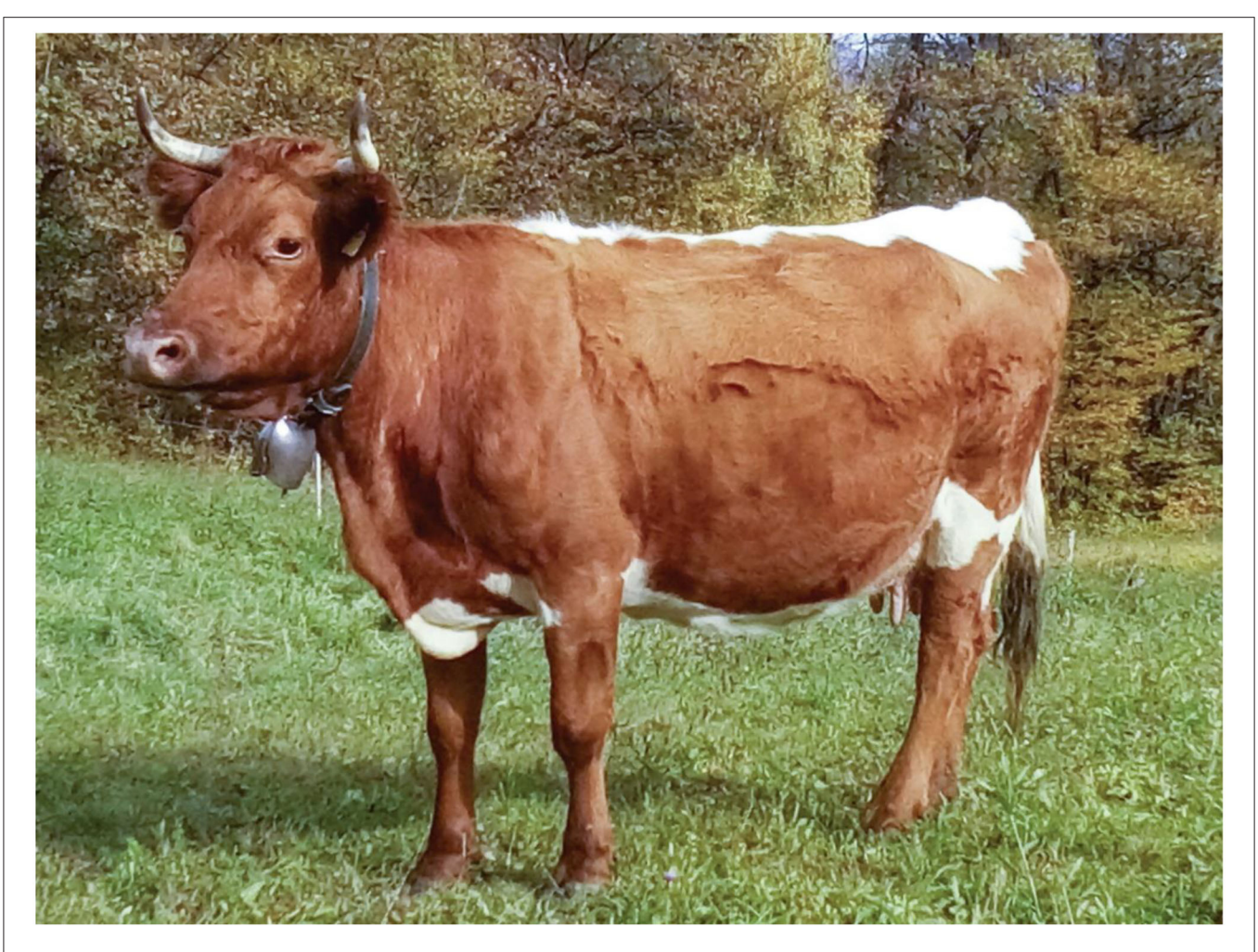
FIGURE 2 | Autochthones Slovenian Cika breed.

do not participate in the official programme, they cannot have the official status.