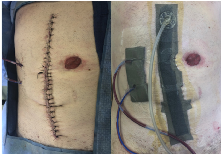
FIGURE 1: Incisional Negative-Pressure Wound Therapy with PolyMem Wic Silver®

high-risk patients underwent dilute chlorhexidine lavage of the soft tissue, placement of subcutaneous closed suction drains for incisions deeper than 3 centimeters, and iNPWT (Figure 1). Incisional NPWT was created using PolyMem WIC Silver as a base over the closed incision, with black foam placed on top.