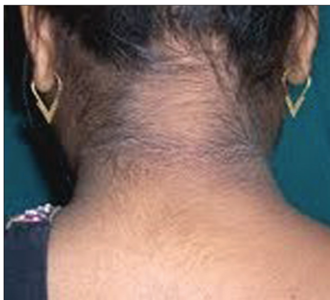
Figure 2: Acanthosis nigricans