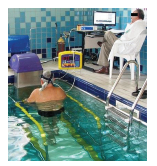
Figure 1 - Test conducted on an underwater treadmill under supervision of a cardiologist.

Experiment profile for the five stages, environment and study group in each variable (Table 2).