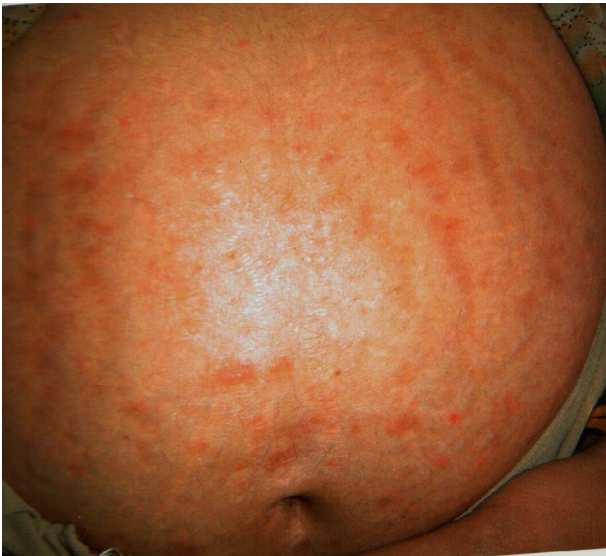
Fig. 6 Impetigo herpetiformis.