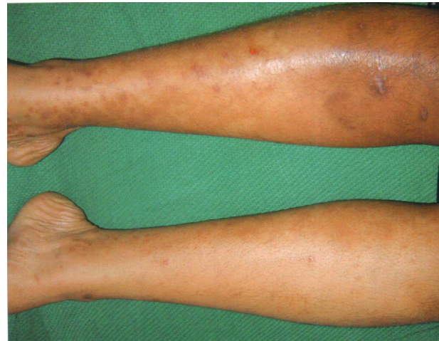
Fig. 8 Prurigo gestationis.

had onset in the third trimester. The diagnosis of pruritic folliculitis was confirmed by a negative Gram stain and bacterial culture. Of the eight women with PUPPP, five gave a history of atopy. There were three cases of prurigo gestationis (Fig. 8) and all of them had a history of atopy.