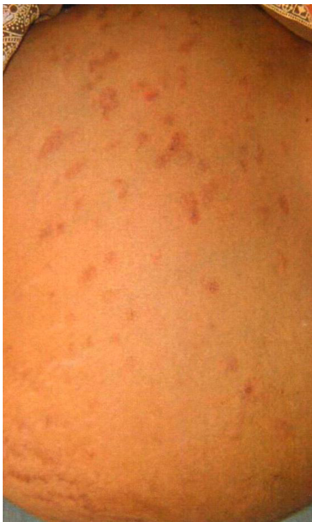
Fig. 7 Pruritic urticarial papules and plaques of pregnancy.