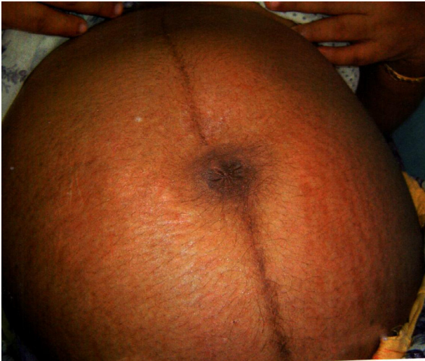
Fig. 1 Linea nigra.