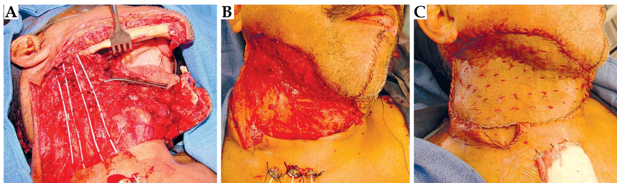
Fig. 1. Intraoperative photographs of A) brachytherapy catheters (HDR) in place, B) catheters covered by pedicled pectoralis major muscle flap (note catheters emerging from skin), and C) overlying split thickness skin graft

A total of 23 patients were included in this retrospective study; 6 had flap coverage and HDR, and 17 had flap coverage and LDR. The mean age of patients in the HDR group was 57.3 \pm 10.3 years, and the mean age of patients in the LDR group was 68.9 \pm 13.9 years (Table 1). The diagnosis was recurrent squamous cell carcinoma (SCC) in 21 of 23 subjects (91.3%) with recurrent melanoma in one patient who presented with lymph node metastases in the cervical lymph node chains, and one with recurrent mucoepidermoid carcinoma of the submandibular gland. The interval to recurrence was 17.0 months (range 4-72). Seventy-four percent of patients received previous chemotherapy, and all patients had undergone previous radiation therapy with dose range 60-70 Gy in conventional fractionation (Table 1). The type of neck dissection performed by the head and neck surgery service in the 23 patients was a radical neck dissection in 10 patients (43.5%), modified radical neck dissection in 6 patients (26.1%), and selective neck dissection (some combination of levels 1-4) in 6 patients (26.1%). Only 1 patient (4.3%) did not undergo a formal neck dissection, because he had previously undergone radical neck dissection (Table 1). Pedicled pectoralis major flaps alone were performed in 83.3% of subjects in the HDR group (5 of 6), and 76.5% of subjects in the LDR group (13 of 16). Split-thickness