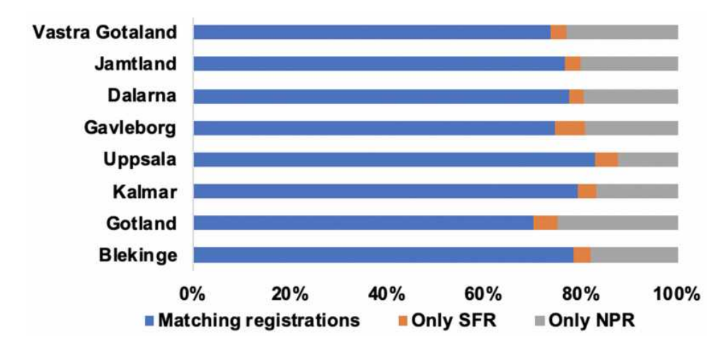
Figure 2 Calculation of completeness in the SFR (Swedish Fracture Register; attached counties) and NPR (National Patient Register) in 2016–2018 according to the adjustment algorithm.

Sahlgrenska University Hospital showed a lower completeness level than the NPR (88%) but a perfect PPV (100%) for acute humeral fractures. This demonstrates that it is possible to achieve valid registrations in a NQR based on voluntary means.