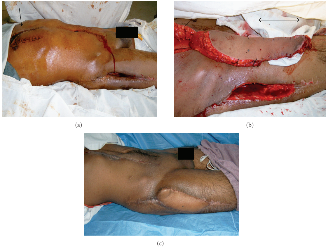
FIGURE 1: (a) A two-week picture after delay procedure (surgical and vascular delay) for extended inferiorly based VRAM flap. The arrow points to line of demarcation between nonperfused and augmented perfused skin in the parasternal fasciocutaneous extension of the VRAM flap. This extension provided additional predictable length of 7 cm for coverage of exposed plate femur after osteosarcoma resection of the proximal femur. (b) Intraoperative picture after harvesting of VRAM flap and debridement of necrotic thigh flap. The VRAM extension marked by the suture markings of the delay procedure provides the extra length avoiding tension and providing durable coverage. (c) Postoperative picture 3 months during chemotherapy course showing complete survival of the flap providing stable coverage and complete healing of the donor site.

detected. All patients were ambulant with good limb functions in terms of walking and gait after adequate rehabilitation; 2 needed additional support with crutches. All patients showed good emotional acceptance; and no pain has been observed during ambulation in all patients. One patient developed incisional hernia at the donor site that required repair 1 year later; otherwise, no other donor site morbidity was noted. Another patient died of haematogenous metastatic spread after complete resection 15 months later. There was no hypertrophic scar formation or flap breakdown experienced on long-term follow-up in any of the patients.