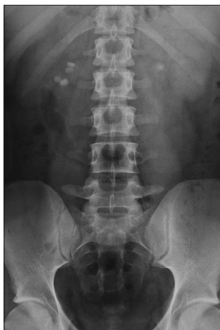
Figure 1: Plain X-ray of the abdomen (KUB) showing bilateral multiple radiopaque renal calculi, more in the right side

The patient presented 24 h after the procedure to the emergency room with severe renal colic bilaterally with normal renal function (100 mmol/dl), and he was admitted for pain control. The next day, abdominal X-ray revealed bilateral steinstrasse with remaining renal stones [Figure 2]. CT scan revealed multiple fragmented stones in the right kidney, one single stone in the left kidney, and bilateral multiple small stones occupying distal ureters on both sides (bilateral steinstrasse) [Figure 3]. We decided for bilateral drainage when serum creatinine rose to 250 mmol/l on the 2 nd day. Under general anesthesia, cystoscopic insertion of the ordinary guidewire on the left side was stopped on the level of the pelvic ureter [Figure 4]. With the help of the pediatric ureteroscopy, hydrophilic guidewire passed with insertion of 5/24 double J (DJ) stent. Retrograde pyelography showed moderate hydroureteronephrosis. The same procedure was repeated on the right side. Postoperatively, the patient had good urine output, and the renal function returned nearly to the normal level.