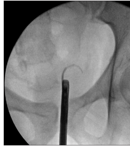
Figure 4: Intraoperative fluoroscopy image that showed failure of the guidewire to pass at the level of the steinstrasse

Regarding the effect of renal function, El-Assmy et al. [7] studied the effect of ESWL on the renal function in 156 patients with solitary kidney. They concluded only a small number of complications and insufficient effect on renal function. However, the long-term follow-up confirmed that ESWL is not only effective but also safe in the long-term follow-up. Similar results were mentioned by Zanetti et al. [8] in 52 patients and Sarica et al. [9] in 43 patients.