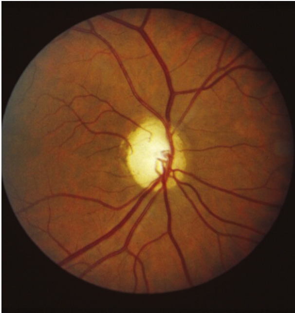
Figure 2 Optic atrophy.

In patients with episodic vertigo – defined as the hallucination of movement – a provocative test (Dix–Hallpike) designed to reproduce an episode can be very helpful diagnostically and therapeutically. The patient sits lengthways on a bed or couch, with a pillow placed so that, as they are reclined by the examiner, it supports their shoulders, allowing the patient’s head to then touch the surface of the bed with an angle of about 30° of neck extension; the examiner adds 45° of rotation to this. In patients with debris in one of their semicircular canals there follows, after a few seconds, a reproduction of symptoms associated with nystagmus, which fatigues with repeated testing. In patients with central disorders, there is typically no delay before the onset of symptoms, and no fatigability.