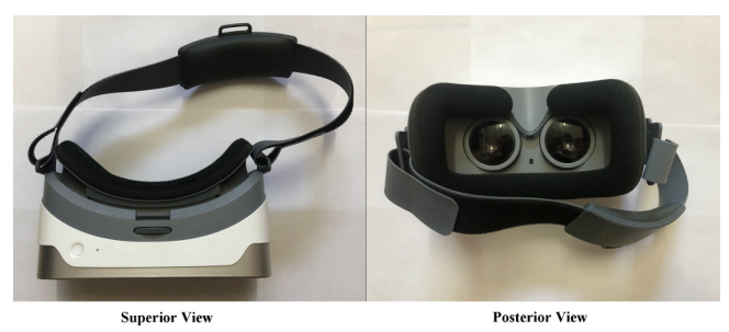
Figure 2 Head-mounted display for virtual reality videos.

In addition to the routine patient education methods mentioned above, patients in the intervention group will watch a VR video using a head-mounted three-dimensional display (figure 2) for about 6 min. Patients will be placed in the simulated settings of an operating room in the VR video. Four parts will be offered, including step by step instructions on bowel preparation, points for attention before and after the procedure, brief introductions to the specific procedures of colonoscopy and a to-do list after a therapeutic procedure (eg, polypectomy). The device can track head movements and