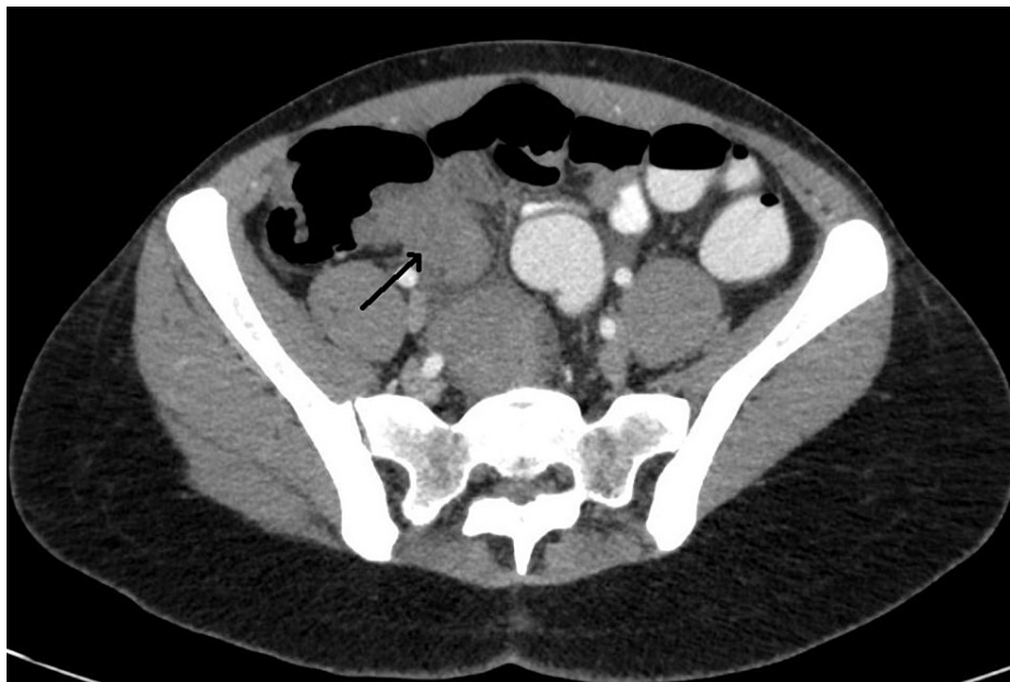
FIGURE 1: Thickening at the ileocecal valve and terminal ileum.

marked fibrosis along the adjoining wall. The area of fibrosis extended partially along with the ileocecal valve and partially along the cecal wall. On microscopy and immunohistochemistry, there were features suggestive of endometriosis with PAX8 and estrogen receptors highlighting glandular epithelium nuclei and CD10 highlighting the surrounding stromal tissue.