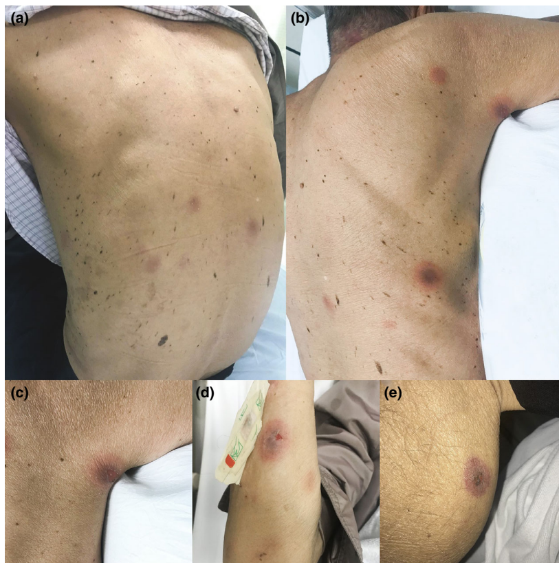
Figure 1 (a,b,d) Round to oval, erythematous to violaceous patches with central dusky appearance on the trunk and limbs; (c,d,e) large and well-demarcated central erosions were also noted on (c) the axilla and trunk; (d) right forearm and (e) right leg. No mucosal lesions were observed and the lesions were found in > 2 different sites of the body.