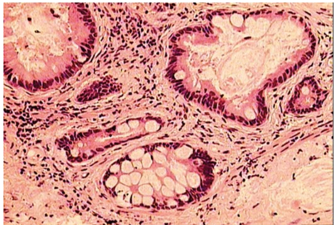
FIGURE 2B. Microscopic appearance of the distal ureter cancer. Hematoxylin and eosin staining (20 x magnification).