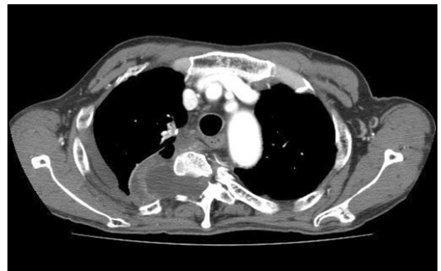
Fig. 3. Postoperative chest computed tomogram shows a markedly decreased cystic mass of the posterior mediastinum and no sign of CSF leakage.

intrathoracic drainage tube near the suture site and sutured the thoracotomy site. We prevented an abrupt CSF pressure elevation by keeping a constant pressure level of the suture site by controlling the amount drainage from the CSF drainage tube after the surgery. The patient was extubated immediately after the operation, stayed in the intensive care unit (ICU) without any problems and was transferred to a general ward the next day. We removed the chest tube on the seventh postoperative day after confirming that there were no complications such as suture site rupture or CSF leakage by chest computed tomography (Fig. 3). After the surgery, the patient did not suffer from chest discomfort or dyspnea anymore. He was discharged from the hospital on the fourteenth postoperative day and is now receiving regular outpatient follow-up care. He is doing well, and other than pain on the surgery site, he is without any complications such as the recurrence of thoracic meningocele or rupture of the suture site at one year follow-up.