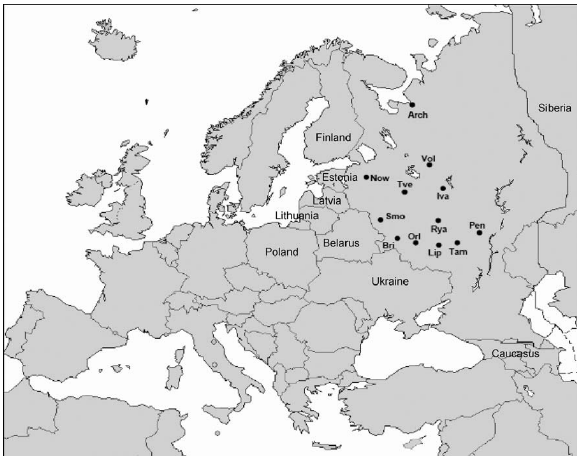
Fig. 1 Map of Europe depicting the analysed populations from the European part of Russia and neighbouring territories

Characteristic parameters for each population, consisting of the number of different haplotypes, the discrimination capacity ( D ) and the haplotype diversity ( h ), were calculated (Table 1). Pairwise values of \Phi_{st} , an analogue of Wrights F_{st} that takes the evolutionary distance between individual haplotypes into account [7, 8], were calculated to measure