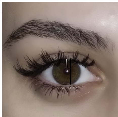
Fig 1. Marginal reflex distance ( white lines ) and palpebral fissure ( black lines ).

significant elevation of the eyelid by 2 mm, and the noticeable elevation persisted for up to 2 hours. We did not repeat the procedure. We remeasured the palpebral fissure and MRD1 to confirm elevation of the droopy eyelid. Photographs were taken before application (Fig 2, A) and 1 hour after application (Fig 2, B). No side effects were observed.