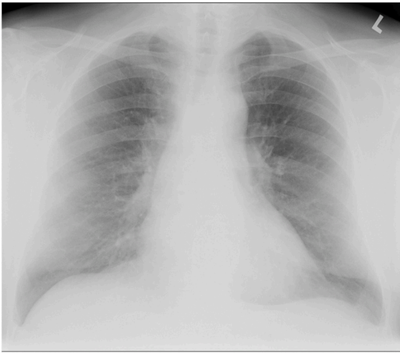
Fig. 1. Preoperative chest x-ray – no visible metastasis.

failure occurred because of high blood loss (3000 ml) together with unsolved serious aortic stenosis. We tried to eliminate subsequent circulatory collapse with direct heart massage. However, it was ineffective, and the patient died in the operating theatre.