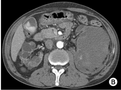
FIG. 3. Case 2. (A) Enhanced Computed tomography (CT) scan showed a 10x7.2x13 cm hyperdense hematoma in the left retroperitoneum; however, no solid tumor could be identified in the area of contrast material extravasation. (B) 2 weeks after follow-up enhanced CT scan displayed increased size (8.7x12x13 cm) of hematoma with improved prominent tortuous vascular structure.