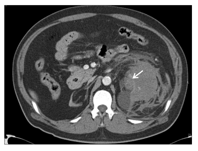
FIG. 1. Case 1. Enhanced Computed tomography scan revealed a 3.2x2.5 cm sized ill-defined enhanced mass in the lower pole of the left kidney (arrow), which had acute extravasation of contrast material.

creased by 2 points compared with his baseline value. No anti-coagulatory agents were included in his outpatient medications. An enhanced abdominal CT scan revealed a 3.2x2.5 cm sized ill-defined lobulated mass in the lower pole of the left kidney, which had acute extravasation of con-