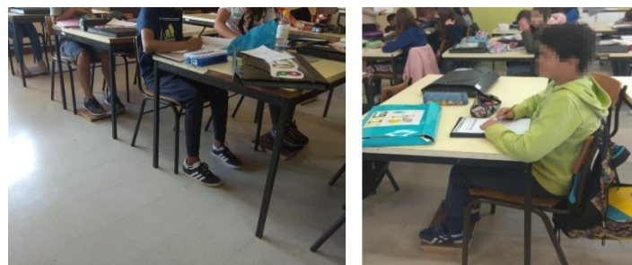
Figure 2. Use of wooden boxes for feet support.

In GA, 3 sessions for each class were performed separately, both of a theoretical and practical nature, lasting 45 min and at intervals of 1 week. In the third session, each student was individually analyzed and corrected for the sitting position and, if necessary, changes were made in the school environment related to furniture, to meet the requirements of correct posture (for the smaller students, wooden boxes were made so that they could support the feet) (Figure 2). Besides that, each student's backpack was assessed for the adjustment of the backpack close to the student's back, backpack weight, and distribution of school supplies.