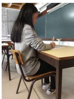
(a) Seated posture task

Finally, in the task called “Transportation, storage and weighing of the school backpack” 4 items were evaluated: The student was asked which is the most frequent way of transport of his/her backpack (should use the 2 handles one on each shoulder); the adjustment of the backpack to the body of the student was verified (the backpack should be adjusted very close to the back); how the material was distributed was verified (lighter materials, such as snacks and cases, should be further away from the back and the heavier material, such as books and notebooks, should be closer to the back); and whether the weight of the backpack was adequate to the weight of the student was verified. The backpack and student were weighed using a SECA 780 digital scale with a capacity of 150 kg and a precision of 100 g. A backpack was classified as having excessive weight if it was more than 10% of the individual’s body weight [3].