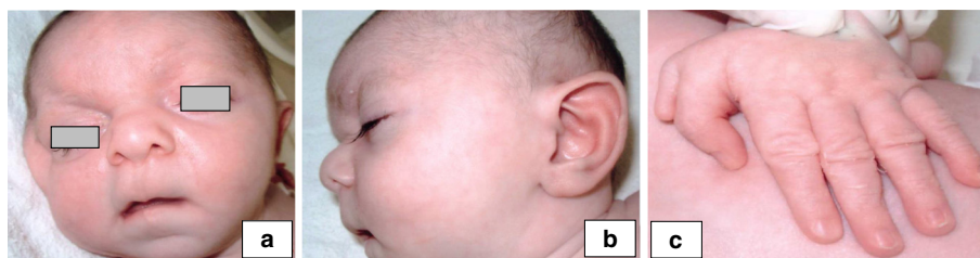
Fig. 1 Dysmorphic features in a LGS patient, that was referred to our Department of Medical Genetics. a A bulbous tip of the nose, a long and flat philtrum and a thin upper lip vermilion, b large laterally protruding ears and a depressed and broad nasal bridge and c pre-axial polydactyly

Parental balanced chromosomal rearrangement is an important cause of copy number alteration in the offspring. A recent study revealed that approximately 2.1 % of duplications and deletions associated with developmental delay originated from parental balanced chromosomal aberrations [24]. Repeat sequences, such as low copy repeats (LCR) around the region of breakage are thought to mediate misalignment between the repeat regions during meiosis, leading to unequal recombination events [25]. However, the incidence of cytogenetically-visible insertions is low [21], and the potential parental carrier