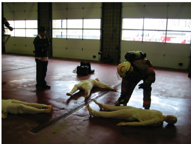
Figure 4 Firefighter using photoionization detector-wearing self-contained breathing apparatus.