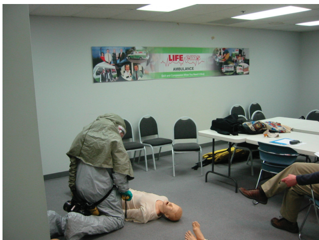
Figure 5 Paramedic wearing powered air-purifying respirator.

The use of a PID for the purpose of identifying potentially contaminated victims has several benefits; the device could be used as a tool which would improve current