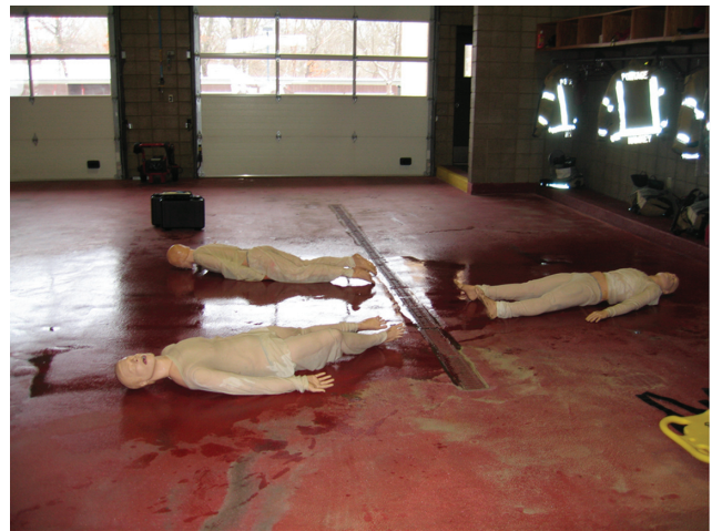
Figure 3 Example of manikins laid out during firefighter trial to represent potential casualties.

water to simulate gross decontamination with fire hoses. This gross decontamination both simulated actual disaster protocol and served to obscure the location of the chemical stimulant. Individual trials involved the contamination of one or more of the manikins; at most, one area per manikin was contaminated. A contaminated manikin could have been contaminated at one of these three locations: