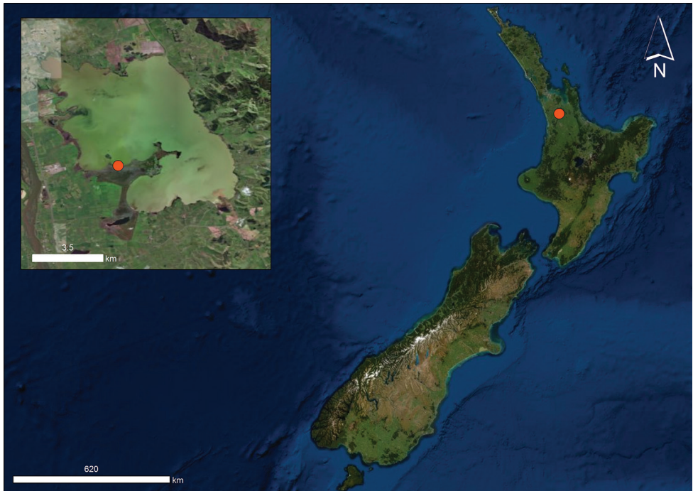
Figure 1. Distribution of Lechytiya novaezealandiae sp. nov. in New Zealand (orange circle).