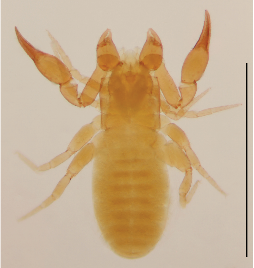
Figure 2. Lechytiopsis novaezealandiae sp. nov., paratype female, dorsal. Scale bar: 1 mm.

(♂, ♀); tarsus 5.50\times (♂), 4.33\times (♀) deeper than broad. Legs robust, heterotarsate; tarsi with two elongate gland openings along the dorsal surface, each with crenulated margins (Fig. 3G); arolium slightly shorter than claws, claws simple.