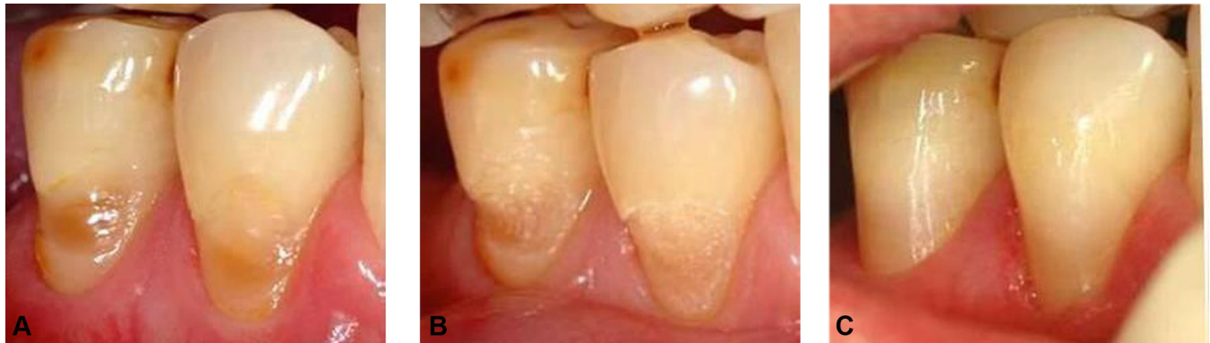
Fig 1. Non-carious cervical lesions of teeth 44 and 45 after laser preparation and restoration with Venus® (Heraeus Kulzer, Germany). Class V resin-composite restoration of a non-carious cervical lesions in premolars (44, 45). (A) Initial lesion. (B) After Er,Cr:YSGG laser-based cavity preparation. (C) Cured and finished resin-composite restoration.

https://doi.org/10.1371/journal.pone.0270312.g001