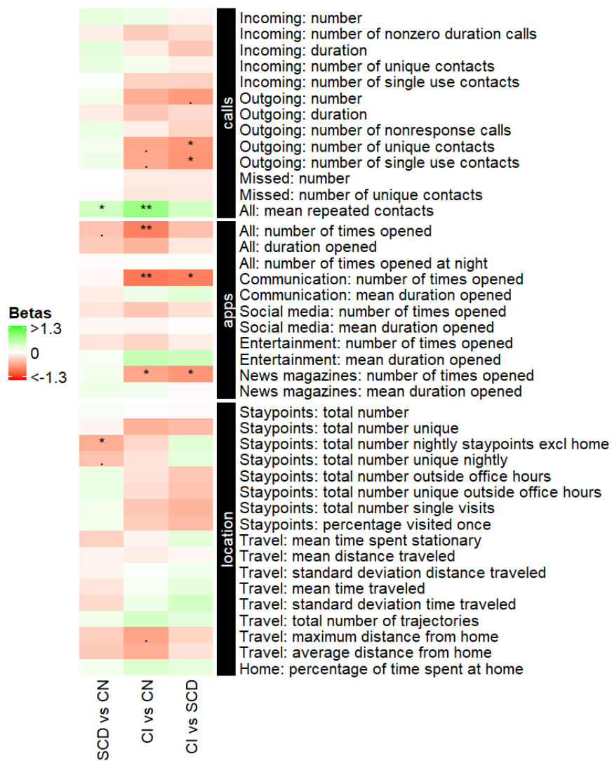
Figure 1. Differences in Behapp outcomes between the 3 diagnostic groups (cognitively impaired [CI], subjective cognitive decline [SCD], and cognitively normal [CN]) participants. Green squares indicate that the first mentioned group shows on average higher values on that Behapp outcomes than the second mentioned group. Red squares indicate that the first mentioned group shows on average lower values on that Behapp outcome than the second mentioned group. All analyses are corrected for age, sex, and education (ie, Behapp outcome ~ diagnostic group + age + sex + education). ** indicates P < .01 ; * indicates P < .05 ; . indicates P < .10 , after correction for multiple comparisons. SCD: subjective cognitive decline; CN: cognitively normal; CI: cognitively impaired.