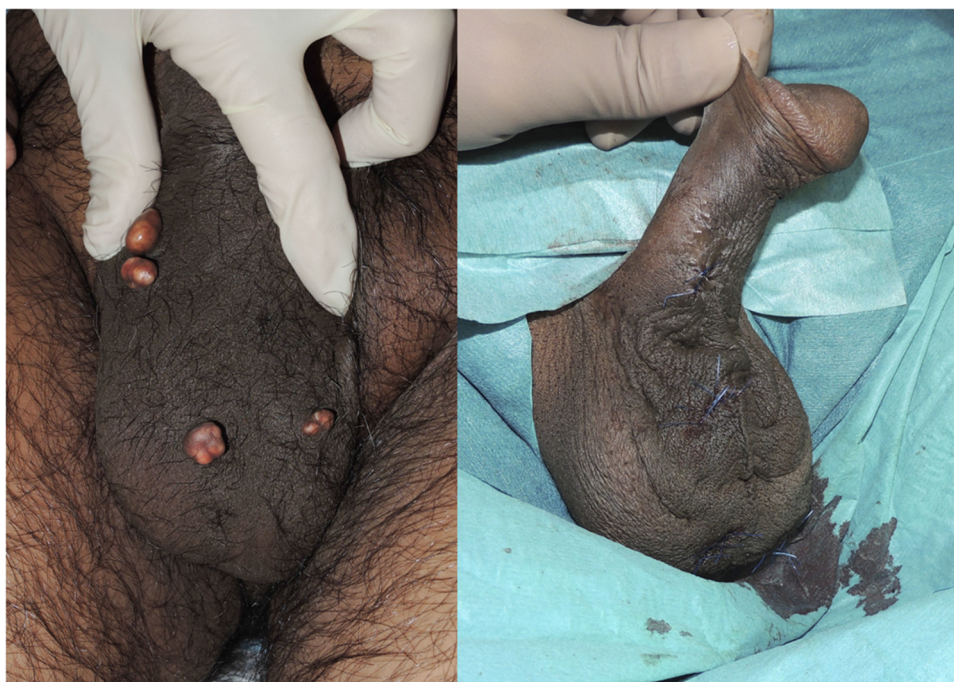
Fig 1. Firm flesh-colored nodules within the scrotal dermis before and after surgery.

ogist with 5 scrotal nodules. The lesions had gradually increased in size during the last 2 decades without causing any symptoms or discomfort besides cosmetic reasons. There was no relevant history of previous or actual medical condition. Laboratory examination including serum calcium, phosphorus, thyroid hormone, creatinine, urea, sodium, potassium and alkaline phosphatase levels showed no abnormality.