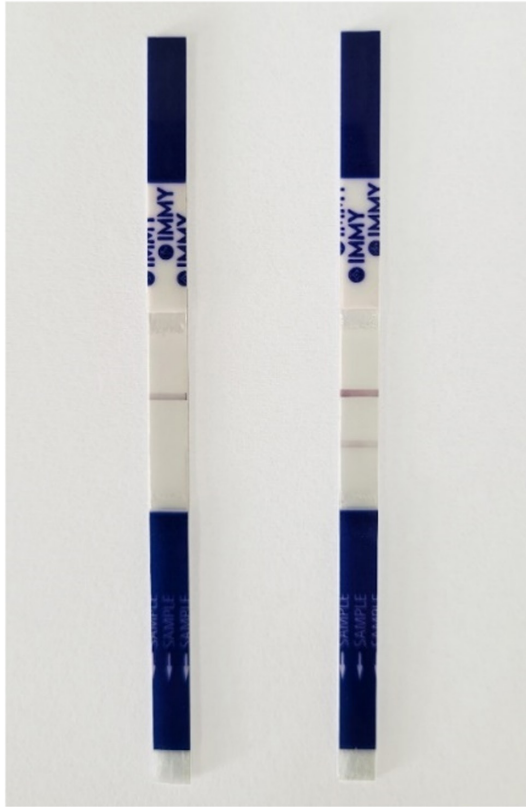
FIGURE 2 Interpretation of Anti-Sporo LFA results. Left: A negative LFA, interpreted by only the presence of the control line. Right: A positive LFA, result is interpreted by the presence of two lines; the control line (top), and the test line (bottom).

All CTS cases and patients from the control group came from the Curitiba metropolitan area, at the Parana state in Brazil. Among the group of patients with CTS, 116 subjects with sporotrichosis were identified. Of these, two were excluded due to saproscopic infection. Another 10 patients were excluded because CTS was classified as possible. Additionally, four individuals were excluded