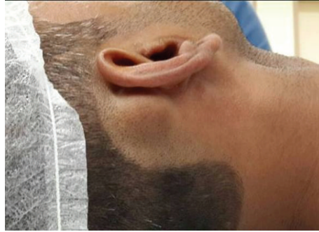
FIGURE 1: Osteoma external appearance.