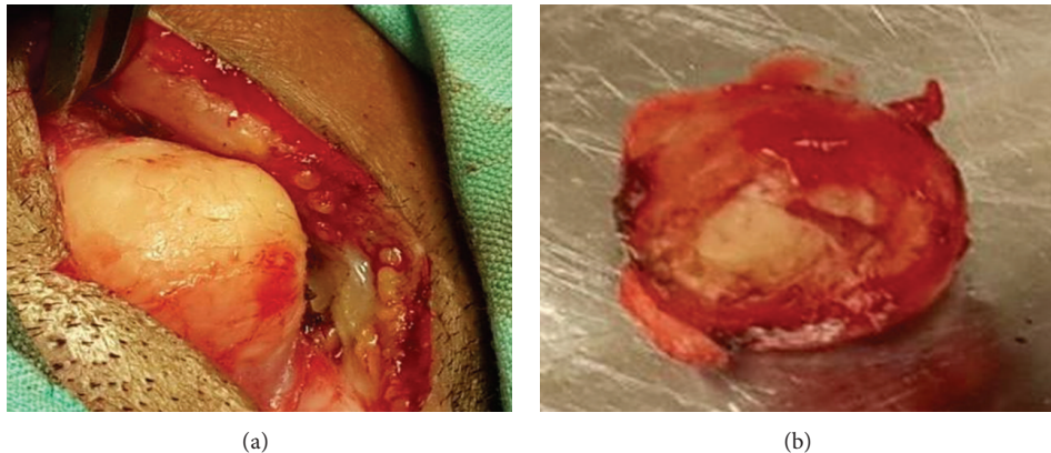
FIGURE 3: (a) Osteoma after freeing it all around before its excision. (b) The specimen after removal.