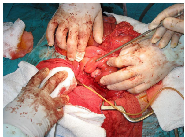
Figure 2 Two end-to-end anastomoses between the patient's duodenum and pedicled loop of ileum.