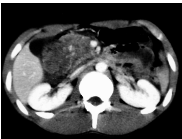
Figure 1 A computed tomography scan of the patient's abdomen showing a retroperitoneal haematoma at the duodenal level.

In order to restore the continuity of the patient's duodenum, we decided to interpose a pedicled loop of ileum (middle part of ileum) to bridge the gap. The two end-to-end anastomoses were performed at two layers (the bottom one in continuous suture) following catheterisation of Vater's papilla through a choledochotomy so that the papilla could be located and immobilised, in order to avoid including it in the suture line (Figures 2 and 3). Finally, a T-tube was placed through the choledochotomy and an intraoperative cholangiography confirmed that the patient's bile duct was unobstructed and the contrast agent was passing freely into the duodenum. There was no loss of blood during the operation. For better recovery, the patient was transferred to the intensive care unit, where he stayed for five days without presenting any particular problems.