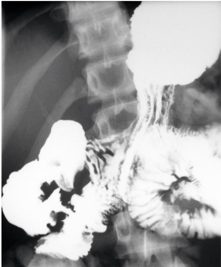
Figure 4 An upper gastrointestinal contrast study on the 20 th postoperative day, without pathological findings.

duodenal perforations from duodenal haematomas [9,10]. In our case report, the deterioration of the patient's clinical status including haematemesis and the inherent high suspicion of abdominal injury indicated the investigation of the intraperitoneal and retroperitoneal space with a CT scan. Although the CT scan did not show any duodenal disruptions, its findings combined with the clinical findings and the history of the accident increased our suspicion of a possible retroperitoneal duodenal injury.