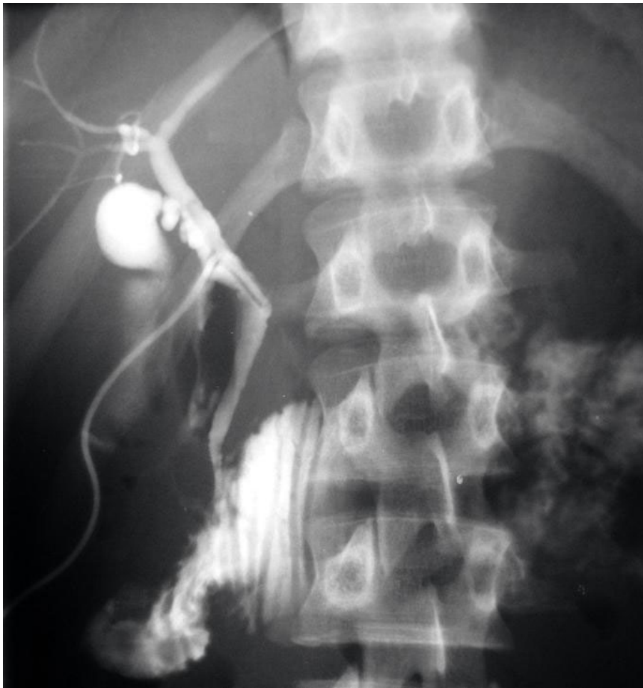
Figure 5 An intraoperative cholangiography after the reconstruction showing the contrast agent passing freely into the patient's duodenum.

case report, these aspects were decisive for the characterisation of the patient's injury and surgical technique selection.