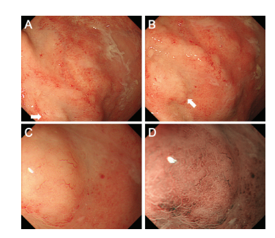
Figure 2. Oesophagogastroduodenoscopy images. A slight elevation of the mucosa and partial change in the mucosal colour to off-white are observed in the gastric body (A). Close examination (B) and magnified observation (C) showed elongated and distorted microvessels. Magnifying observation with narrow-band imaging revealed that the gastric pits were preserved (D).