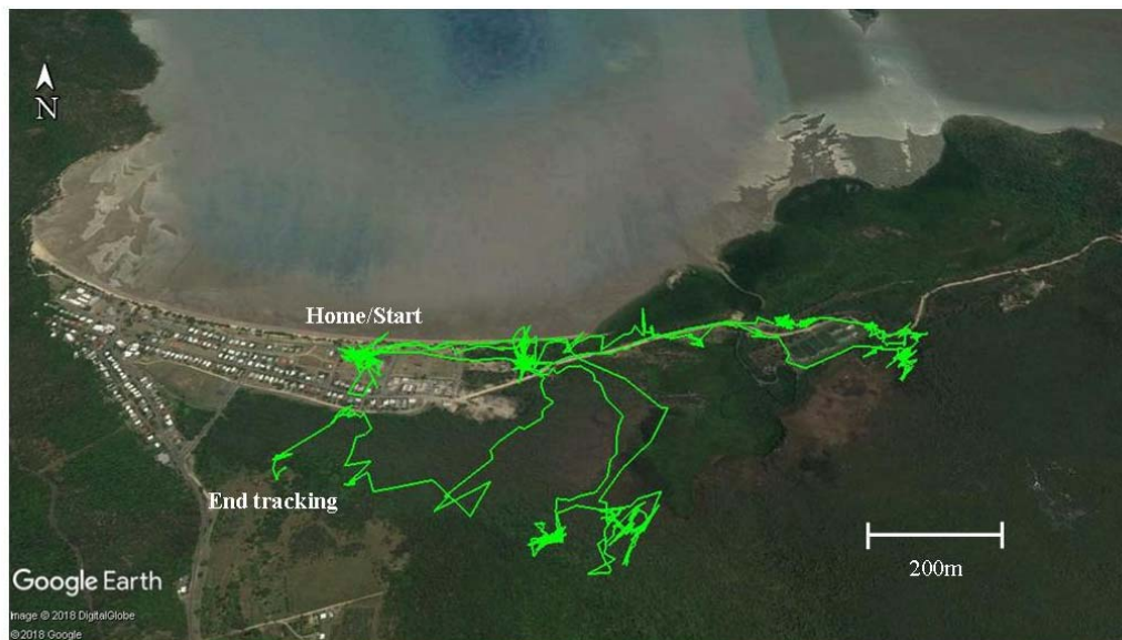
Figure 2. Track map from i-gotU GT-600 (Mobile Action Technology, Taipei, Taiwan) data logger for female domestic dog CD01 over 96 h in Yarrabah showing forays away from urban boundaries as viewed on Google Earth engine.

Following the download of data showing a particularly long foray where all five dogs from the same household had visited a site for a whole day and then revisited for several days afterward, the first author investigated the site and found the remains of a pig carcass. It was impossible to determine how the pig had died due to decomposition and scavenging. Thus, it may have been shot and left by a local hunter or killed by dingoes. It was most unlikely that the dogs killed the pig as no high-speed chase was recorded prior to the dogs' extended time at the site. The young male dingo (TD12) was also tracked in this area at a later date.