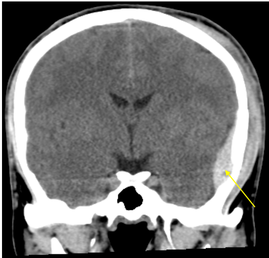
FIGURE 1: Non-contrasted coronal CT demonstrates hyperdense lentiform epidural hematoma in the left temporal lobe with maximum thickness measuring approximately 1.4 cm (yellow arrow).