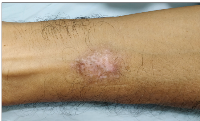
Figure 3: Complete regression of the lesion after 4 months of treatment

polymorphous nature of the presentation, the clinical picture can be misleading and differentials can include other fungal infections such as fixed sporotrichosis, bacterial infections like cutaneous tuberculosis, leprosy, actinomycetoma, mycobacteriosis, and others like cutaneous leishmaniasis, verrucae, squamous cell carcinoma, psoriasis, sarcoidosis, and Bowen's disease. [3] Our patient was diagnosed with chromoblastomycosis after a period of 4 years. The initial biopsy findings suggestive of morphea could be attributed to scarring sometimes seen in the plaque and cicatricial types or in a previously healed area of this chronic fungal infection. The clinical morphology of the lesion could also have been modified due to the use of various topical medications. Furthermore, this case highlights that differentials for a solitary plaque should include infections (deep fungal, mycobacterial, atypical mycobacterial, and leishmaniasis), cutaneous tumors, granuloma annulare, and other inflammatory skin conditions. Our patient responded well to treatment as he was immunocompetent and the lesion was localized and mild in severity.