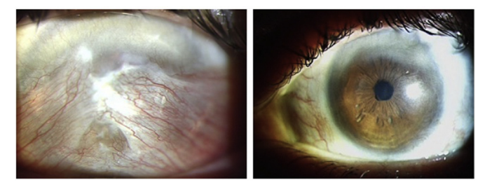
Fig. 2. 2a – Double-headed recurrent kissing pterygium in a patient with prior pterygium surgery six years earlier. 2b – Post-operatively, the cornea was clear and there were no signs of recurrent pterygium in this aggressive case.

double-headed kissing pterygia covering the majority of his left cornea. Prior ocular history included pterygium excision six years prior with conjunctival autograft and adjunctive use of MMC. The pterygia were associated with dense scarring and fairly diffuse LSCD, secondary to chronic vernal keratoconjunctivitis and blepharitis. Presenting visual acuity was counting fingers at 1 foot.