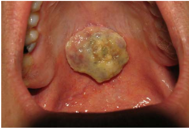
Figure 1. The schwannoma presented as a pedunculated mass in the midline of hard palate with an ulcerated yellowish surface.

two-month history of an asymptomatic mass in his palate. He had no history of systemic diseases. Extraoral examination revealed no significant signs. There were no palpable lymph nodes. Intraoral examinations revealed a 2×2-cm pedunculated mass in the midline of the palate. The lesion was non-tender and firm in consistency and had an ulcerated yellowish surface in most areas (Figure 1). There were no osseous alterations on occlusal radiographs (Figure 2). Salivary gland tumors and benign mesenchymal lesions were included in the differential diagnosis. Incisional biopsy was performed under local anesthesia. Histopathological evaluation showed proliferation of spindle-shaped cells with palisaded arrangements around the central acellular area in most parts. Areas of less cellularity and less organized portions were also observed (Figure 3). The overlying epithelium had been replaced by a fibrinopurulent membrane. The results of immunohistochemical