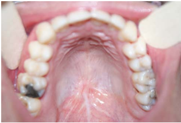
Figure 5. After 6 months the patient is without recurrence.

cases of palatal schwannoma have been reported in the English literature, which have been summarized in Table 1. Among the reported cases females have been affected more than males; 4,5,10-14,15 however, this case was observed in a male patient. Gender distribution of tumor in various studies is different. William et al showed that schwannomas have a predilection for males, while in the study of Lucas, there was a greater predilection for females, and Hatziotis and Asprides, and Enzinger and Weiss reported an equal distribution between both sexes; 4,8 however, there is a high tendency for female among the reported cases. 4,5,7,10-15