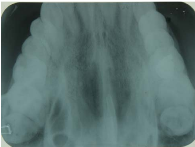
Figure 2. There is no osseous alteration on the occlusal radiograph.

staining for S-100 protein were positive (Figure 4). According to histopathological and immunohistochemical findings the diagnosis was schwannoma. After one week, complete excision of the lesion was carried out under general anesthesia and the final histopathological diagnosis was schwannoma, too. After 6 months of follow-up there was no recurrence of the lesion (Figure 5).