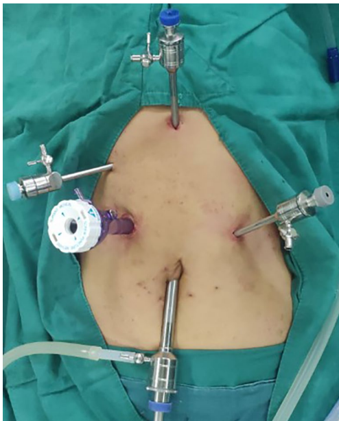
Figure 2 Abdominal operating hole.