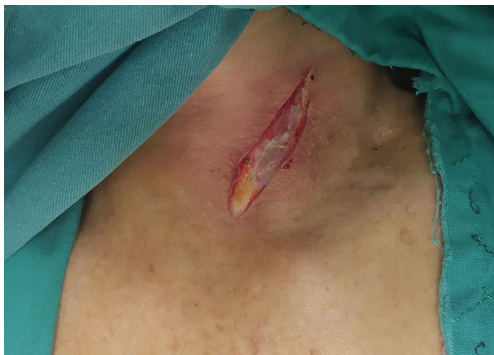
Figure 3 The neck incision.

incision of the mediastinal pleura, dissection of the free thoracic oesophagus and lymph nodes was performed. Oesophageal dissociation, all dissection procedures and azygos vein dissociation and cutting were all completed via the two main operative holes. Following chest dissociation, the chest was closed and a closed thoracic drainage tube was placed in the endoscopic hole.