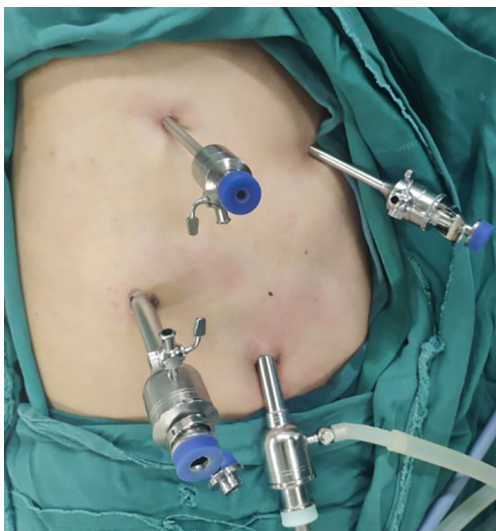
Figure 1 Chest operating hole.

surgical instruments and the optimization of the operative techniques, the scope and depth of endoscopic surgery has been expanded unprecedentedly, which makes the endoscopic McKeown resection procedure for oesophageal carcinoma possible and gradually become the first choice for clinicians and patients. Over time, we observed that the combination of non-artificial pneumothorax and double-lumen endotracheal intubation were associated with a small tissue space, increased bleeding, a longer surgical process and difficulty with exposure of the left laryngeal recurrent nerve chain lymph nodes. Currently, artificial pneumoperitoneum with CO 2 is considered safe and effective. Establishment of artificial pneumothorax with CO 2 is based on the same principle as that of artificial pneumoperitoneum. During this procedure, CO 2 is pumped continuously into the chest cavity at a controlled flow rate, where it enables a stable positive pressure in the pleural cavity that collapses the lung and exposes the operative field.