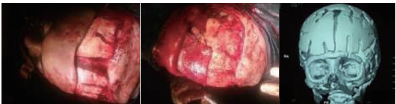
Fig. 3. 3D computed tomography showing effective reconstruction by craniotomy.

In terms of surgical procedures, five cases (27.8%) underwent endoscopic technique (ET), 10 cases (55.6%) underwent craniofacial reconstruction, and three cases (16.6%) underwent open burring of the metopic ridge. So the open technique (OT) was 13 patients (72.2%). Estimated blood loss was 55 mL in ET and 150 mL in OT. Operative time was 1.6 hours in ET and 2.8 hours in OT.