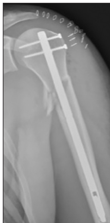
Figure 4: Plain anteroposterior X-ray after intramedullary fixation on the first postoperative day