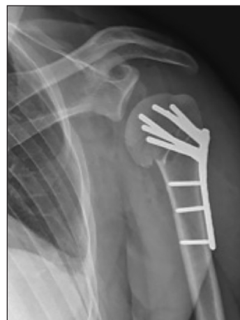
Figure 2: Plain anteroposterior X-ray after open reduction and internal fixation on the first postoperative day

One year postoperatively, the patient did not recover his preinjury level of performance. His absolute Constant-Murley score reached 76/100 (12/15 pain; 18/20 activities of daily living [ADL]; 40/40 mobility; and power 6/25) versus 91/100 (15/15 pain; 20/20 ADL; 40/40 mobility; and power 16/25) at the unaffected side with only restrictions for power. X-ray confirmed consolidation of the proximal humeral fracture, with varus malunion, and shortening of the medial column [Figure 3].