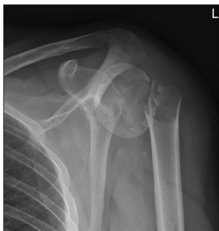
Figure 1: Plain anteroposterior X-ray of the two-part surgical neck fracture. Notice the proximal and lateral displacement of the distal fragment, further than the lateral cortex of the proximal fragment

A 33-year-old man was injured in his upper body by a falling metal fence. He was admitted to the emergency department of the University Hospital Ghent. Clinically, he had no apparent neurovascular dysfunction of the left arm. More specifically, the sensory function of the axillary nerve was normal. Motor evaluation of the upper arm was impossible due to pain inhibition. Plain X-ray [Figure 1] showed a comminuted two-part surgical neck fracture of the humerus, with a proximal, lateral and posterior displacement of the humeral shaft. Computed tomography scan confirmed this position of the distal part and showed an undisplaced fracture of the greater tuberosity.