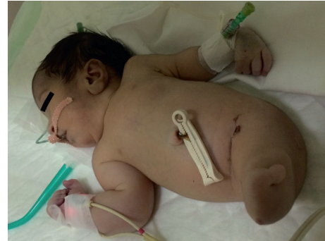
FIGURE 2: Sirenomelic baby with fused lower extremities and absent feet.