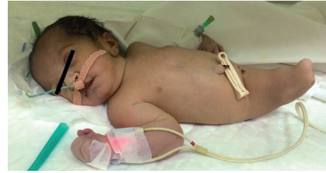
FIGURE 1: Sirenomelic baby showing no genitalia.

The phenotypic characteristics of sirenomelia are associated with varying degrees of severe multiorgan abnormalities commonly involving the urogenital and gastrointestinal systems. Other observed abnormalities in sirenomelia involve lumbosacral and pelvic malformations, which include sacral agenesis, malformed vertebrae and hemivertebrae, absent or malformed external and internal genitalia, imperforate anus, and CNS abnormalities. Pulmonary and