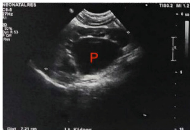
FIGURE 1: Ultrasound showing severe left PUJO at presentation.

an obstructive drainage pattern. The Right kidney had 78% split function and a normal drainage pattern. An early pyeloplasty during the same admission was planned.